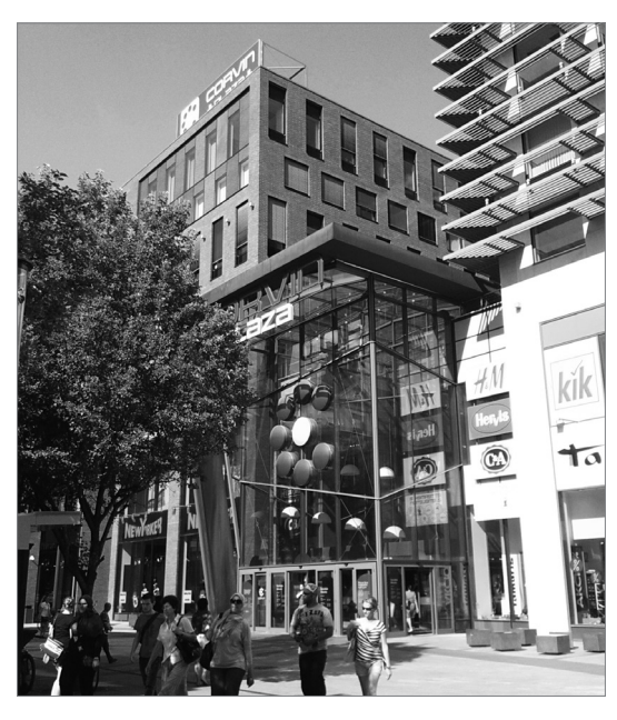
Fig. 6: Residential buildings of the Corvin Promenade project